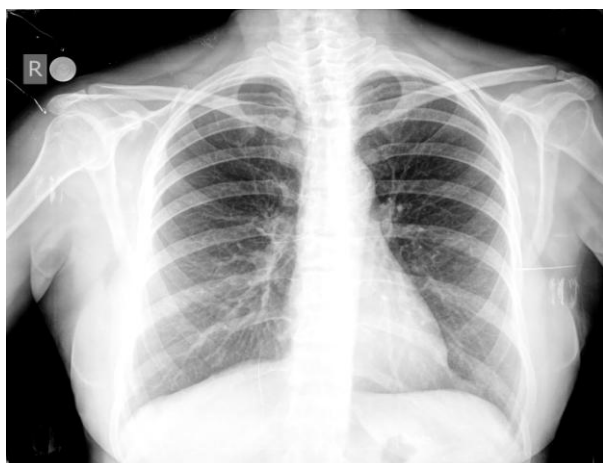
Fig. 1b. Chest X ray of the patient after one week