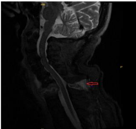
1A. Lesions compatible with epidural abscess are observed in C7 - T1 bodies.(arrow)

Conclusion. NCS refers to the compression of the left renal vein between the SMA and aorta. Dilatation of the proximal portion of the vessel due to increased pressure gradient with resultant venous hypertension and rupture of the thin-walled veins into the collective system is the mainstay of hematuria (from the left ureteral orifice only). Other clinical features of NCS are left flank pain, pelvic pain and gonadal varices. Orthostatic proteinuria has also been reported. This is a rare syndrome but to be considered in case of hematuria of unknown origin.