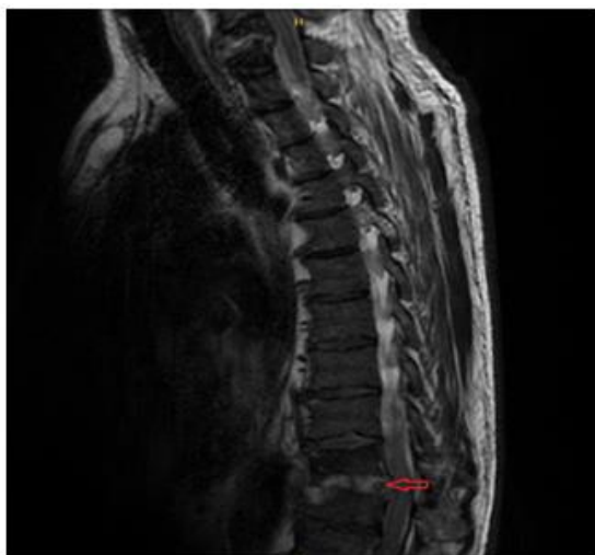
1B. Lesions compatible with epidural abscess are observed in T10 - T11 bodies.(arrow)

Fig. 1. MRI thoracic and cervical spine with contrast MRI, Magnetic resonance imaging; C, cervical spine; T, thoracic spine